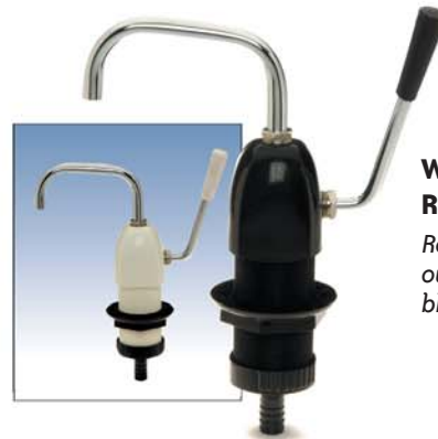
WS-63 ROCKER PUMP Rocker pump with raised outlet spout. Available in black or white.