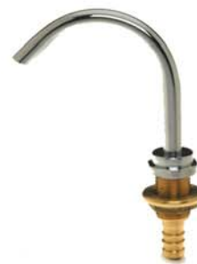
WS-69 SPOUTS High quality spouts offer angled flow. Available in brass or chrome.