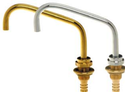
WS-66 SPOUTS High quality spouts with vertical output. Available in brass or chrome.

High-quality outlet spouts for marine, recreational or commercial applications. Perfect for use with salt water or fresh water.