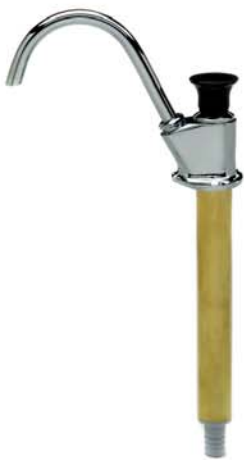
WS-60 GALLEY PUMP Vertical plunger pump with an angled outlet spout. Available in brass or chrome.

Attractive, high-capacity pumps in a range of finishes and styles for use with salt or fresh water. Rugged construction with smooth, double action.