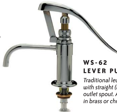
WS-62 LEVER PUMP Traditional lever pump with straight (horizontal) outlet spout. Available in brass or chrome.