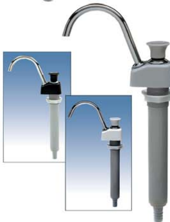
WS-67 GALLEY PUMP Vertical plunger pump with an angled outlet spout. Available in black, white or gray.