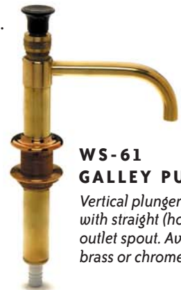
WS-61 GALLEY PUMP Vertical plunger pump with straight (horizontal) outlet spout. Available in brass or chrome.