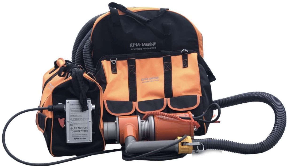
Portable Flood Rescue Pack

IMTRA, a 100% employee-owned company based in New Bedford, Massachusetts, is an importer and manufacturer of high-quality marine products, advanced LED solutions and integrated marine systems, as well as a key supplier to the OEM and aftermarket. With more than 70 years in the commercial, industrial and marine markets, IMTRA has sales and support teams in 12 regions throughout North America. The company's extensive product knowledge is available to its customers through a renowned full-service department, a professional customer service group and an online Learning Center . Product categories include Lighting, Thrusters, Stabilizers, Anchoring Systems, Wipers, Seating, Controls, Doors, Hatches and other specialty products. In addition to their own proprietary products, IMTRA represents well-known international brands that include Sleipner (Side-Power), Norsap, Vimar, Lumishore, BCM Lighting, Lofrans, Muir, Exalto, Zipwake, Roca, Lilaas, DHR, Libra, Victron, KPM-Marine and many more. www.IMTRA.com/about-IMTRA.htm