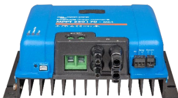
SmartSolar Charge Controller MPPT 250/70-MC4 without display