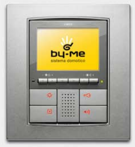
Multi-zone control unit, Next.

Just a few buttons and a display to program the actions and design the scenes. By-me integrates functions of home automation, video door entry, burglar alarm system, multizone climate management and remote control in a single system, devised entirely by Vimar but open to dialogue with Konnex networks.