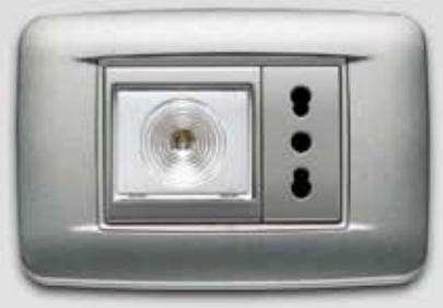
TORCIA, hand lamp

Devices for Comfort : thermostats with display for residential and services sectors; timer-thermostats with 2 and 3 modules, programmable timer-switches and alarm clocks. All with straightforward, user-friendly programming and amber backlighting display and buttons.