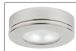
Tide w/Round Base