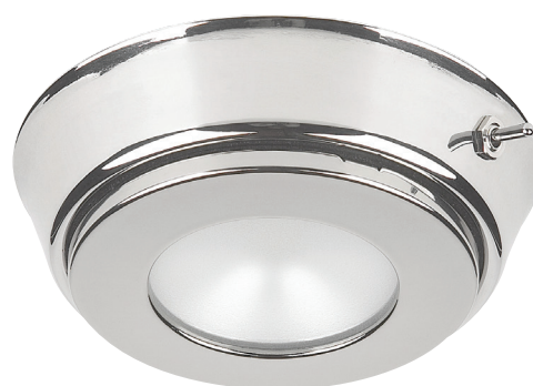
Tide w/Base & Switch